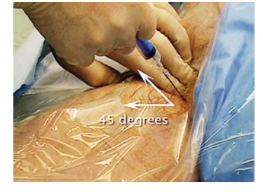
Figure 1. Inserting the Introducer Needle.

Several studies have shown that using ultrasonography to assist in central-catheter placement increases success and reduces complications.<sup>2,3</sup> Choose a linear probe rather than a curved probe for femoral catheter placement. Linear probes emit high-frequency waves that are optimal for viewing superficial structures, such as the femoral vessels. Position yourself toward the patient's feet, and place the ultrasound monitor in front of you. Orient the probe so that the patient's right is on the right side of the screen. Place the probe in a sterile sheath with coupling gel inside. Sterile gel can be applied to the outside of the protective covering. Placing the patient in a reverse Trendelenberg position engorges the femoral vein and may aid in visualization. Ultrasound imaging renders vessel walls brighter than their lumens, which are filled with blood. The femoral vein is collapsible as compared with the artery. Use of the Doppler function of the ultrasound machine may help distinguish pulsatile (arterial) from more continuous (venous) blood flow. Position the vein in the center of the screen, and insert the needle at the center of the probe (Fig. 4). After the ultrasound images indicate that the needle is in an appropriate position for entering the vein, you will also note the intravenous location by observing a flash of blood into the syringe.