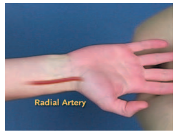
Location of the radial artery.

N Engl J Med 2006;354:e13. Copyright © 2006 Massachusetts Medical Society.