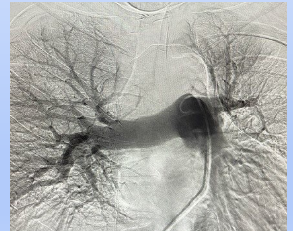
Post thrombectomy demonstrating excellent flow.