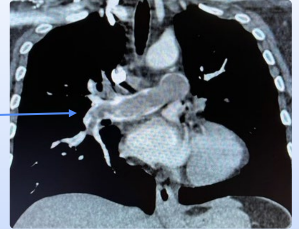
Pre-procedure CT Scan